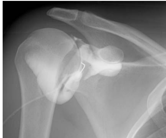
Iodine contrast material has been injected into the shoulder joint - this is a shoulder arthrogram.