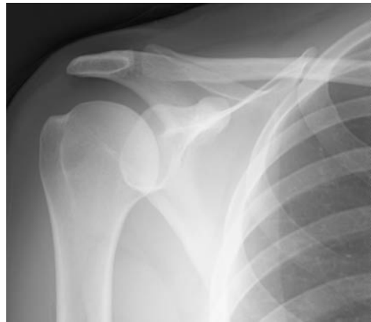
An x-ray of the right shoulder prior to injection of contrast material.